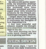
Hooked up: Dawn undergoes analysis

Some of the herbs are leafy herbs and it is quite an effort to prepare them. I am going to help my periods pain. I am prescribed a batch of raw food. I am told to take twice a day to help my irregular periods.